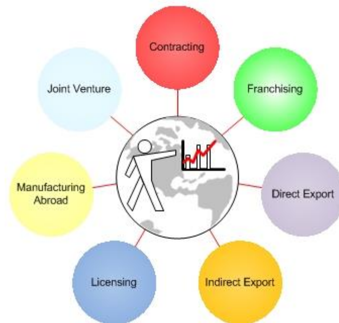
Figure 01: Market Entry Strategies

Further, according to Chung & Enderwick (2001), there are several modes of market entry strategy including direct exporting, foreign direct investment, strategic alliance, licensing and franchising. As illustrated in the below figure 01: